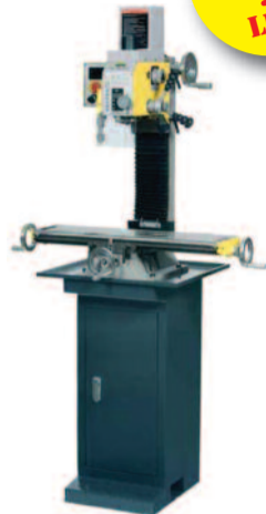
BFM 20L Vario with Stand Variable speed Mill / Drill