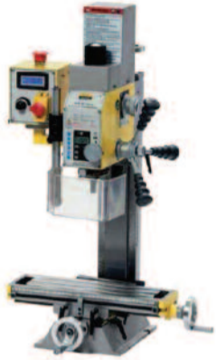
BFM 16 Vario with Stand Variable speed Mill / Drill