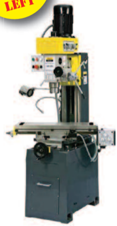
BFM 50 PG with Stand Geared Head Mill / Drill with Power Feed