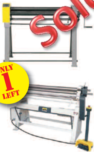
RM-1020-2 Roller Rolling Machine

Working Length 1020mm Sheet Thickness 2mm Weight 250Kg