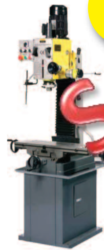
BFM 45 PG with Stand Geared Head Mill / Drill with Power Feed