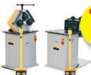
3 models in range 30-40mm box section