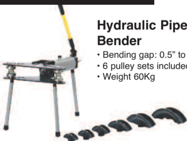
Hydraulic Pipe Bender